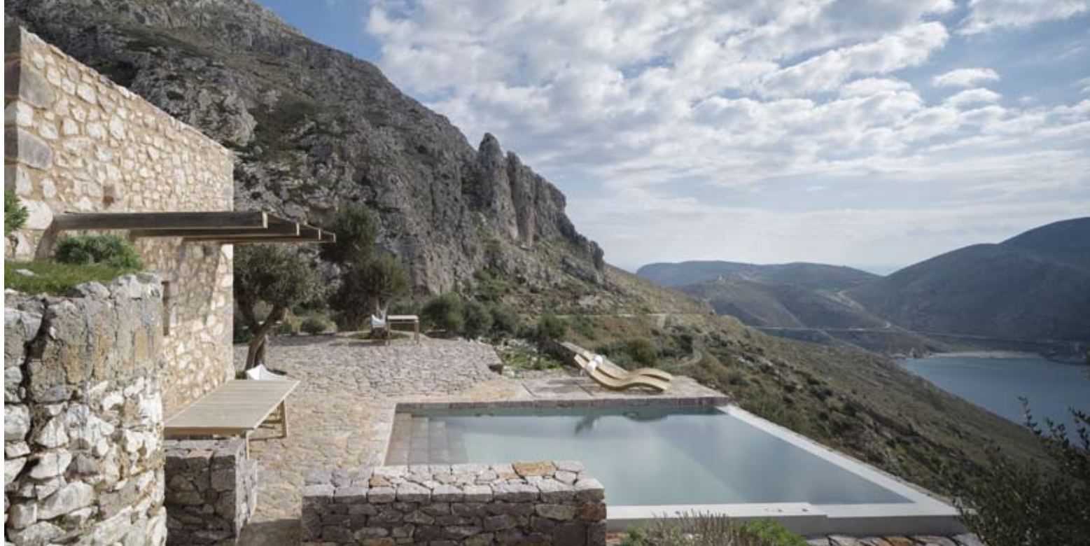
9 外景/Exterior view 10 新建泳池/Swimming pool